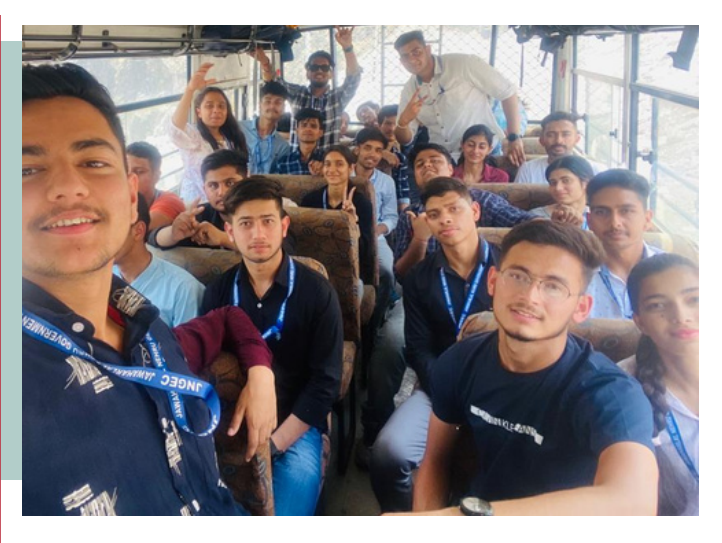
Industrial visit to KolDam of Batch 2020-24

On 19th May 2022, A visit was conducted to Koldam Bilaspur, Himachal Pradesh. The objective of this site visit is to enhance the knowledge among the students regarding the construction. working, and maintenance of hydroelectric projects. Students visited different working sections of the Koldam and were given a piece of detailed information about them. Students have also visited nearby construction sites of bridge and tunnel.